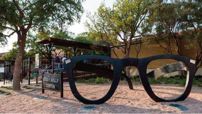
World Famous Buddy Holly Center